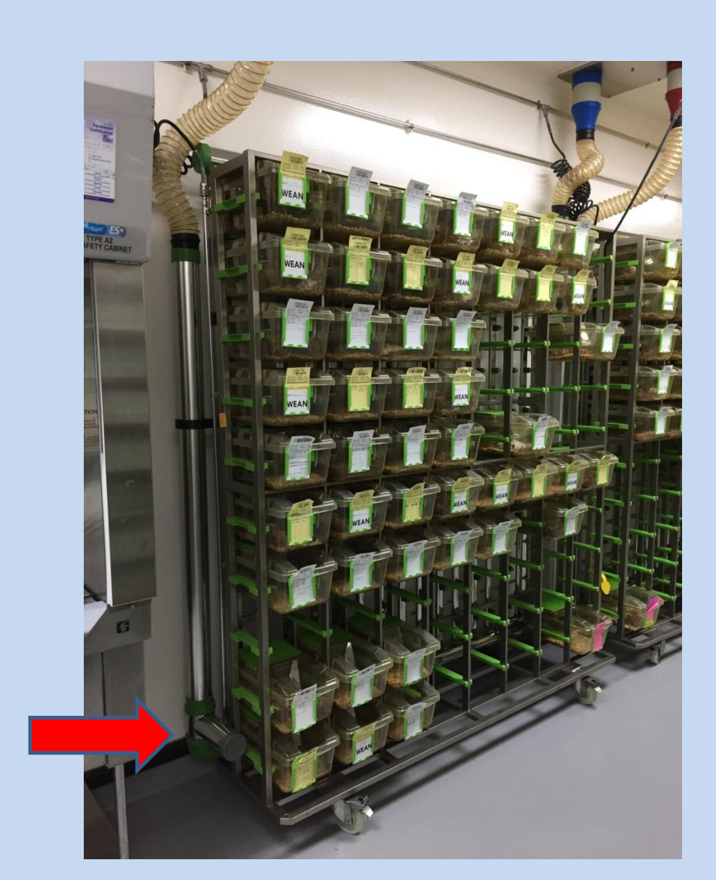
Figure 1. Two racks were fitted with a prototype plenum attachment to perform EAD testing (red arrow).

Animal Housing. All mice were housed in individually ventilated cages (Tecniplast GM500) on racks connected to a central HEPA filtered air supply via a delivery plenum. Ventilation was maintained at 65 to 75 air changes per hour in positive pressure mode. All cages, bedding, enrichment, wire-bar lids, and filter tops were sanitized and autoclaved prior to use. Mice were housed with a maximum density of 5 adult mice per cage under standard environmental conditions (12:12 hour light:dark cycle, 20-24°C, 40% to 60% humidity). Bedding material consisted of ¼ inch corncob and shredded paper nesting material was provided for enrichment. Mice were fed a commercial irradiated diet ad libitum and given UV irradiated, reverse-osmosis-filtered and acidified water via an automatic system. Cages were changed every 14 days. All personnel entering the animal holding room wore dedicated scrubs and clogs, an isolation gown, gloves, head cap and surgical mask. All cage manipulations were performed in a Biological Safety Cabinet or Animal Transfer Station.