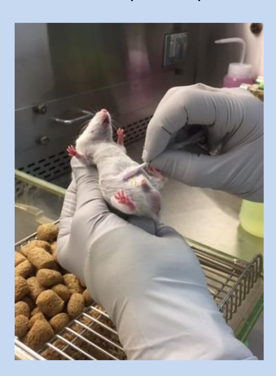
Figure 6. Body swab from colony mice for PCR analysis. Body swabs were performed on the ventral abdomen and perianal region. Oral swabs were also obtained.

Sentinel mice were tested using serology after 60 days and 90 days of exposure to colony cages. Pooled samples (10:1) using direct animal sampling of feces and oral and body swabs (8 random cages from colony mice and 2 samples from sentinel cage per rack; 1 mouse sampled per cage) were submitted for PCR analysis after 60 days and 90 days of exposure to colony cages (Figures 6-8). Interceptor from each rack was submitted for EAD PCR analysis after 7 days and 90 days of exposure to colony cages. A control Interceptor (not exposed to a rack) tested negative after 7 days. All testing profiles were performed by Charles River Laboratories (Table 1).