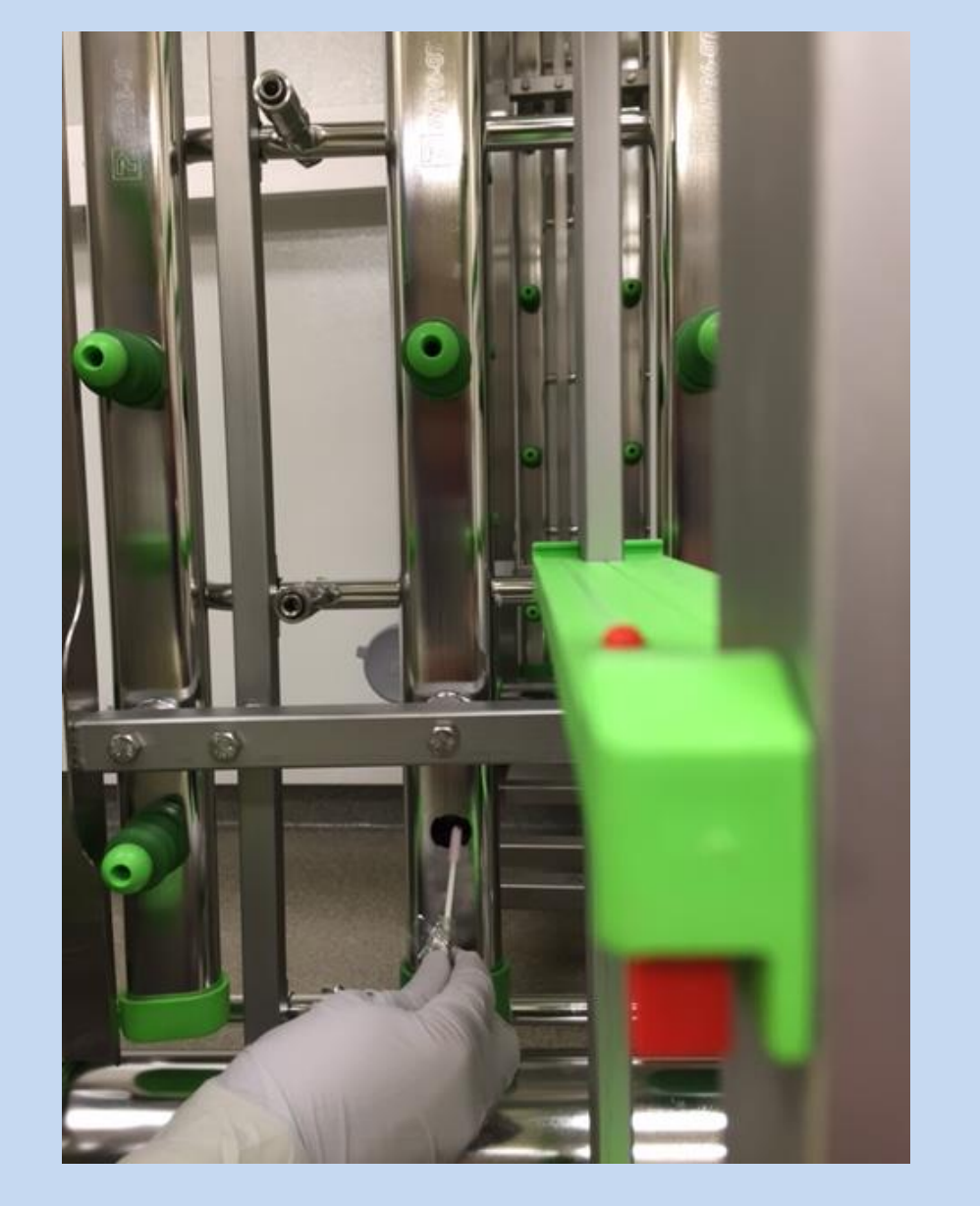
Figure 5. Swabbing of rack plenum for PCR analysis to confirm sterility at beginning of study.

Racks were populated with cages that were changed as they were placed onto the racks. To determine the health status of the mice on the racks, direct animal sampling was performed using pooled samples of feces and oral and body swabs (10 random cages per rack; 1 mouse sampled per cage) submitted for PCR analysis (Table 1). The prevalence of agents on each rack was not known. Interceptor was placed into the plenum attachment of each rack on Day 0. A sentinel cage containing 2 mice was placed on each rack and exposed to 1 tablespoon of soiled bedding from each cage on the rack at the time of cage change (every 14 days).