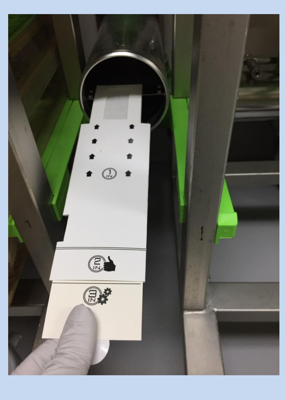
Figure 4. Interceptor being placed into the plenum attachment.