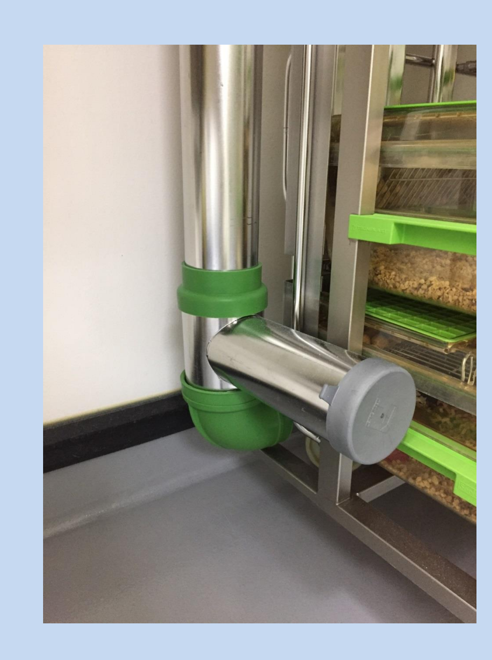
Figure 3. Prototype plenum attachment connected to the exhaust plenum.

To compare EAD analysis with traditional health monitoring techniques, two IVC racks with 80 cage maximum capacity (Figure 1) were fitted with a prototype plenum attachment (Figure 3) to perform exhaust air dust testing using Interceptor (Figure 4). Racks and plenum attachments were sanitized and autoclaved prior to use and confirmed sterile by PCR swab analysis (Figure 5).